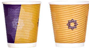
Vistara Airlines, compostable Cups