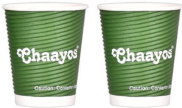
Compostable Paper Cup's