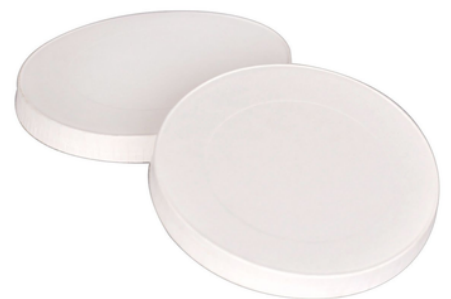
WSPI, 80 mm/90 mm paper lid

All products are tested as per global food safety and packaging standards at an internationally accredited laboratory (SGS) annually . The test reports are shared on demand .