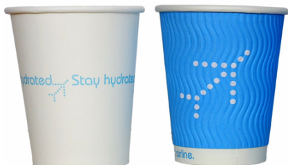
Indigo's Airlines Compostable cups