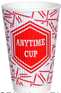
WSPI, 16 oz Ripple